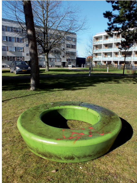
2: Spray with base cleaner (pre-cleaning agent). Let it soak for about five minutes.