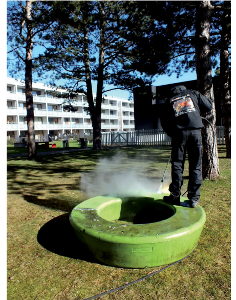
3: Start high pressure cleaning with hot water.