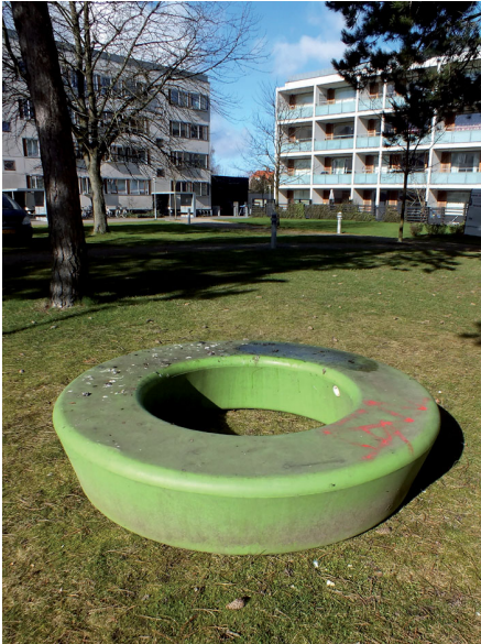
1: Before cleaning (LOOP from a Copenhagen park, 7 years old when these photos were taken).