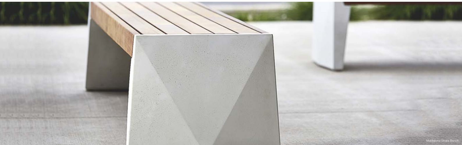
Meldstone Strata Bench