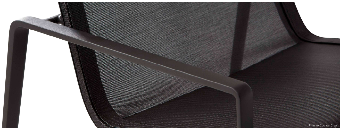
Phifertex Cochran Chair