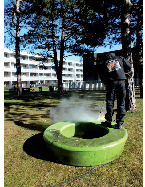
3: Start high pressure cleaning with hot water.