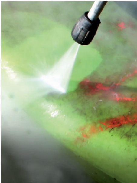
4: Even graffiti can be removed with this method.