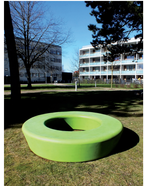
6: End result. After cleaning, use a vinyl polish (same as used for car interiors) to add some shine to the product.